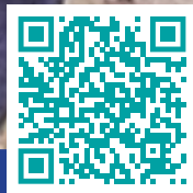
SMART ® BAND FLEX