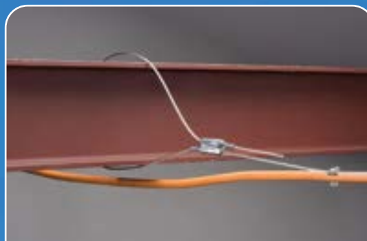
SPEED LINK SLK SYSTEM